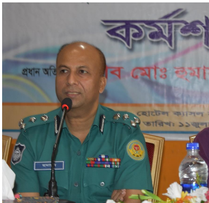
Police Commissioner Delivering His Valuable Speech

Police Commissioner also thanked and appreciated the joint initiative of UNICEF and JJS.